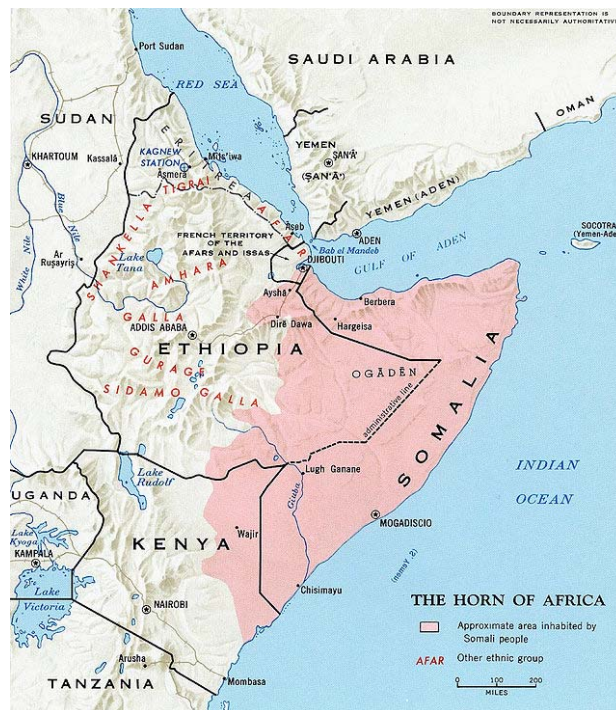
Fig.2: Distribution of Somali speakers (image from wikipedia)