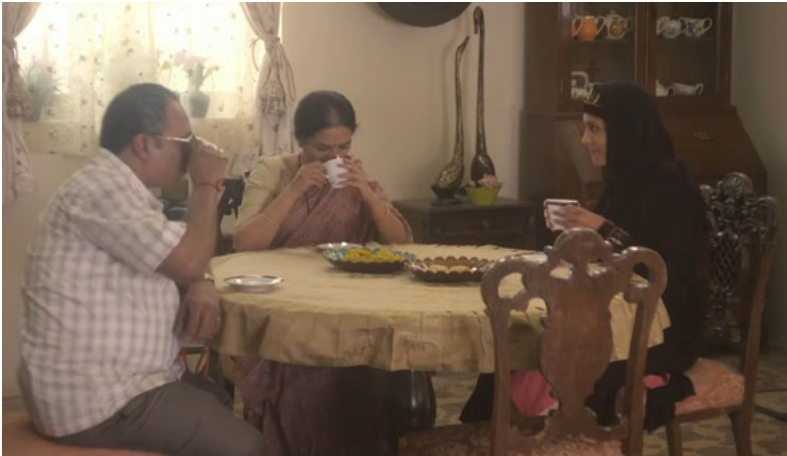
Stills from "Swaad Apnepan Ka: Neighbors," Brooke Bond Red Label India, 2014.

women to a greater extent than other religions do. Muslim women, compared to women of other religions, are most often perceived as submissive, reserved, fragile, and, due to their social conditioning, unable to fight for their own rights. See Sabina Kidwai, Images of Muslim Women: A Study on the Representation of Muslim Women in the Media (New Delhi: WISCOMP, 2003).