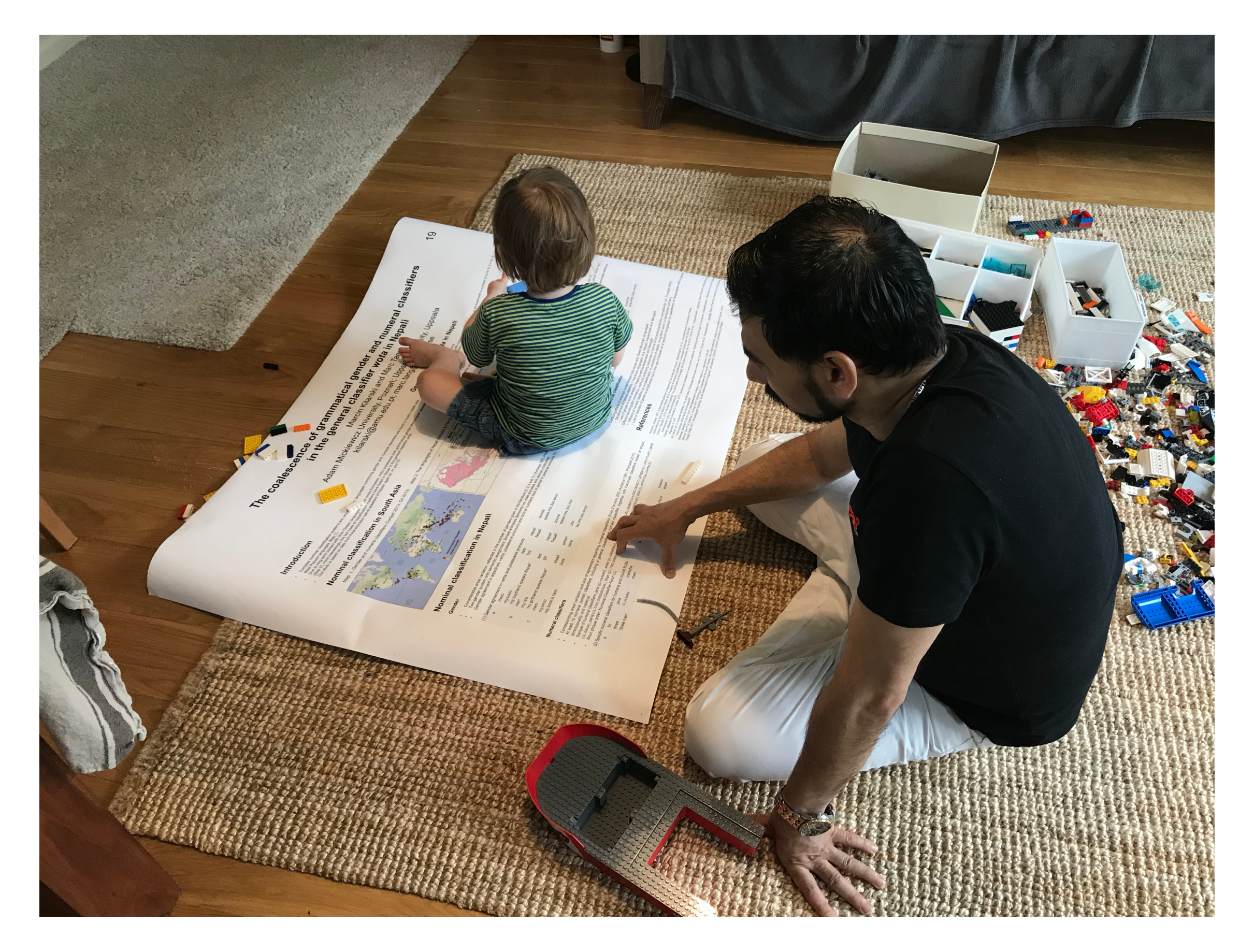
Working on Nepali in Poznań