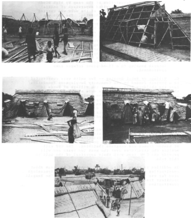
Figure 3, source: Charles H. Goodspeed et al. 1975. Feasibility test of an approach and prototype for ultra low cost housing . Washington: Office of Science and Technology, Technical Assistance Bureau, Agency for International Development, http://hdl.handle.net/1969.1/159947 [retrieved 16.01.21].