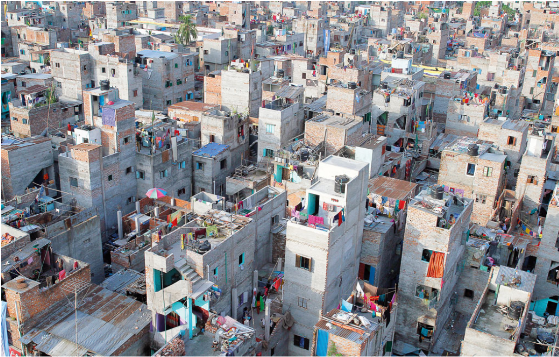
Figure 4, source: photograph by Mahmud Hossain Opu/ Dhaka Tribune .

The camp residents have developed internal protocols for financing, informal cooperative construction, and management (Figure 5). The camp dwellers have also developed a consensual way of locating ownership of each plot (on the basis of oral history) and also help each other by lending capital and with the construction process. From this perspective, the so-called "informality"—an ambiguous term that loosely indicates the absence of authoritarian control—indicates, in the case of the Bihari camps, a space of resistance: the influence and control of the state is minimal within the camp life. Life outside the camp is characterised by the privatisation of personal life, the separation of productive labour from communal relationships (although this is rarely the case), and the increasing obligation of people to face the state as individuals instead of as a community. The unwieldy growth of real estate in the surrounding neighbourhood is driven by the almost deregulated market of Dhaka's real estate. The meaning and courses and tactics of development within the camp are quite different. In contrast, the development of the land, the building construction, and the financing of building activities were supported by personal and communal networks.