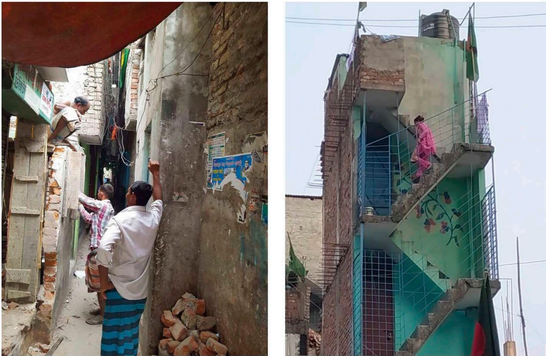
Figure 5, source: photograph by Tasniva Rahman.

While the rigorous collective and cooperative initiatives that constructed the dwelling units testifies to the ongoing drive of the Bihari community to establish their identity, it is important to note here that the camp community conceives the camp not as a collection of disparate dwelling units but instead as a unified whole, albeit having contested parts, creating a contested complementary of the "outside" city. Therefore, an exclusive study of how individual units came into place would ignore essential components of the complex process of making the camp into a unified whole. The camp does not exclusively signify a shelter to its dwellers; rather, the camp is the source of an emancipatory mental space and of a spatial armature enabling the dwellers to counter the experiences of oppression and injustice. One of the ways to understand how the camp, as a mental space, provides the scope for establishing solidarity is the ways in which the children of the camp relate their everyday experiences with the spaces of the camp. A few children of the camp receive education mainly from the camp school, which is operated by the non-government organisation Al Falah, but most students do not have the opportunity to receive any formal education.