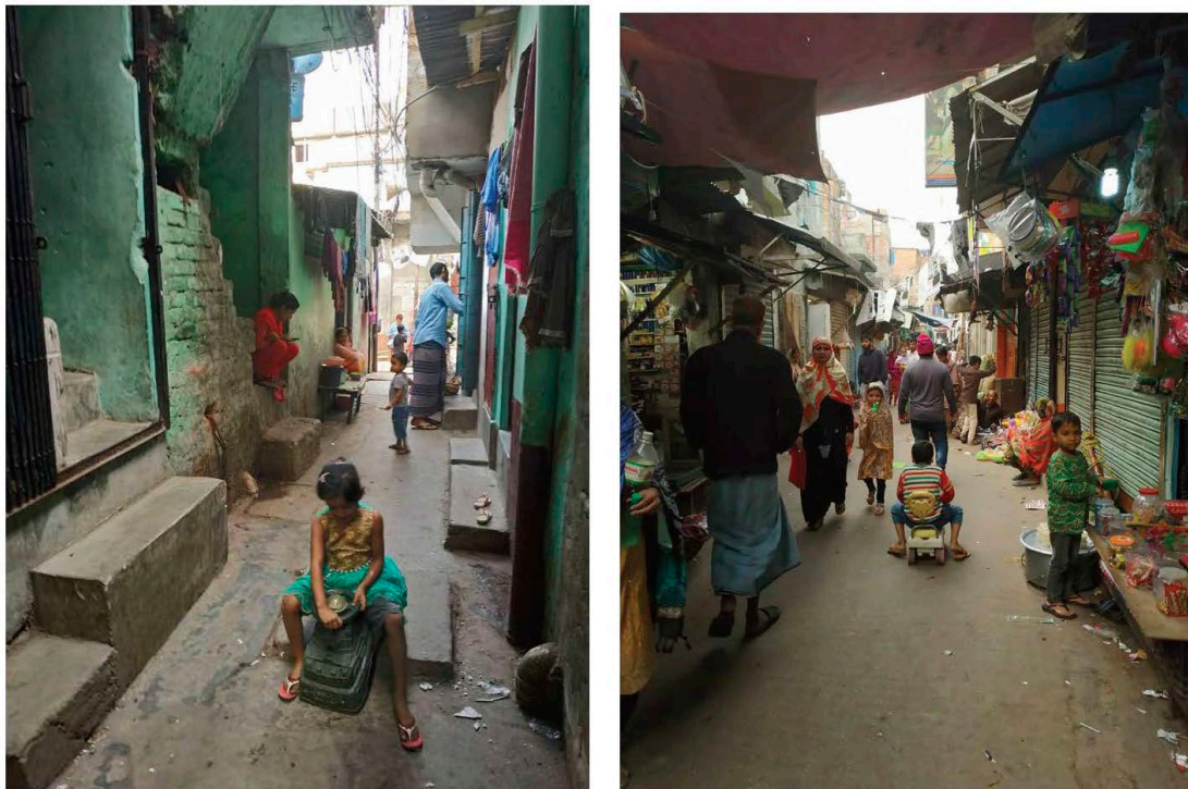
Figure 6, source: photograph by Tasniva Rahman.