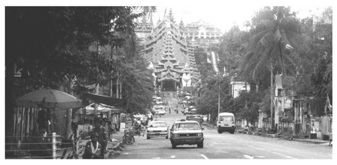
Yangon, Myanmar, was eerily subdued today.

Last Friday, when an Internet blackout in Myanmar made it even harder to estimate the brutality of the crackdown there, Prime Minister Gordon Brown of Britain said his government believed that "the loss of life is far greater than is being reported." The Burmese military junta said that nine people were killed in the unrest.