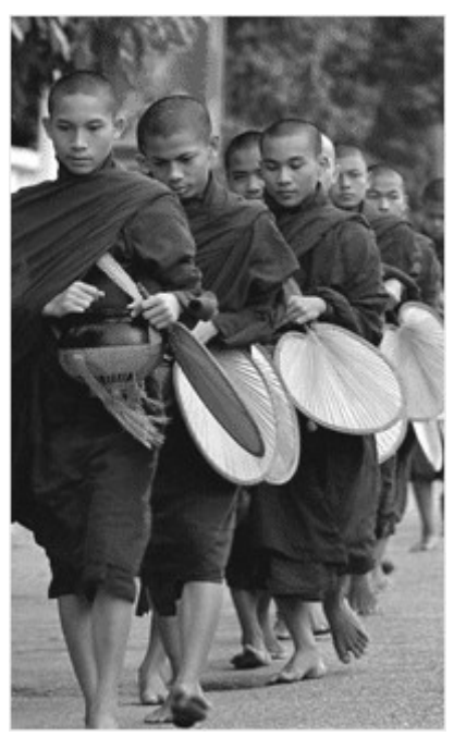
Buddhist monks make their daily rounds in Rangoon

More than 600 monks in the central and upper areas of Burma have taken part in peaceful demonstrations in preparation for refusing alms from the families of military personnel on Tuesday, September 18.