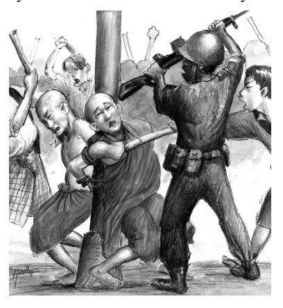
An artist's impression of the violent breakup of the Pakokku protests

More than 10 high ranking officials and military officers were held hostage for about six hours on Thursday by monks at a monastery in Pakokku township in Upper Burma. The captors demanded the release of about 10 fellow monks arrested in a peaceful demonstration that was violently broken up by the authorities on Wednesday.