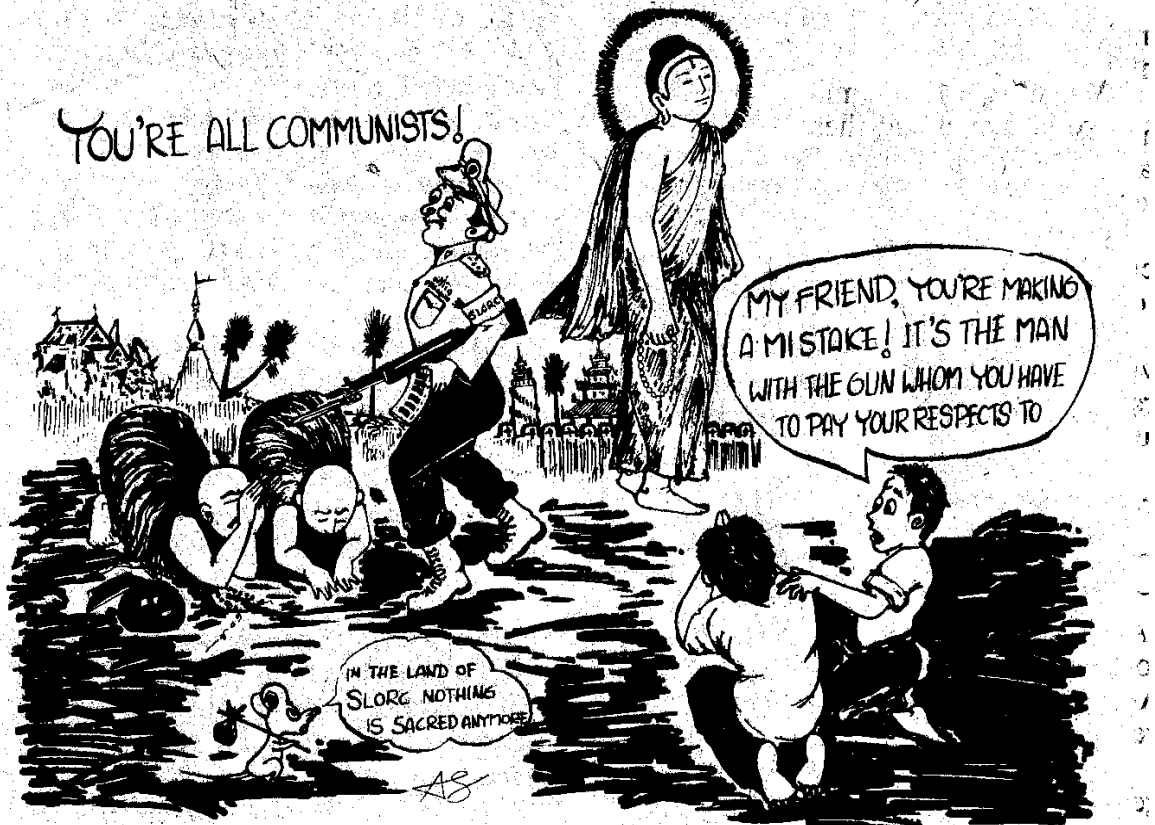
Cartoon from the Thai newspaper The Nation , October 31, 1990