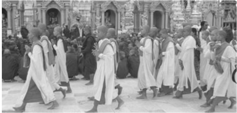
Buddhist nuns join monks and members of the public in Rangoon in the biggest protest against the government since the bloody suppression of the first democracy movement in 1988.

During yesterday's march, one chanted through a megaphone: "Our uprising must succeed."