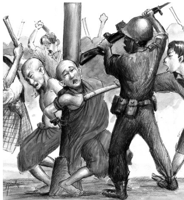
An artist's impression of the violent break-up of the Pakokku protests

More than 10 high ranking officials and military officers were held hostage for about six hours on Thursday by monks at a monastery in Pakokku township in Upper Burma. The captors demanded the release of about 10 fellow monks arrested in a peaceful demonstration that was violently broken up by the authorities on Wednesday.