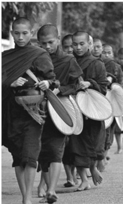
Buddhist monks make their daily rounds in Rangoon

More than 600 monks in the central and upper areas of Burma have taken part in peaceful demonstrations in preparation for refusing alms from the families of military personnel on Tuesday, September 18.