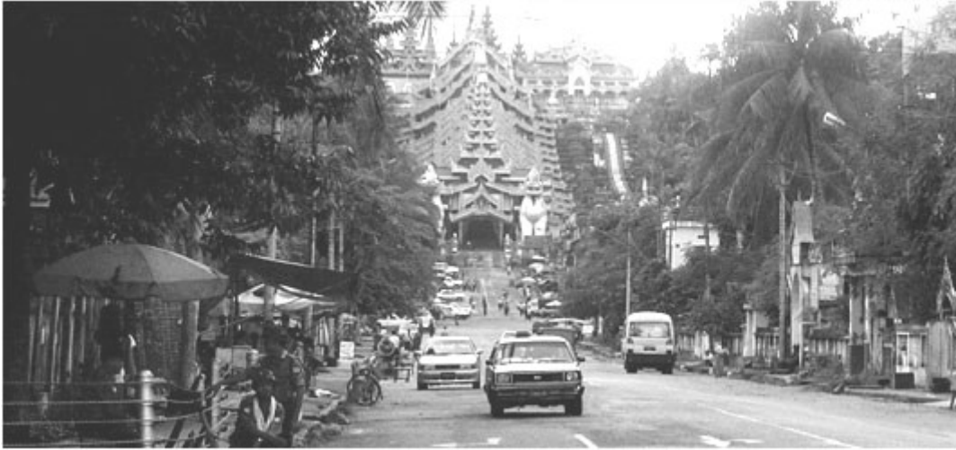
Yangon, Myanmar, was eerily subdued today.

Last Friday, when an Internet blackout in Myanmar made it even harder to estimate the brutality of the crackdown there, Prime Minister Gordon Brown of Britain said his government believed that “the loss of life is far greater than is being reported.” The Burmese military junta said that nine people were killed in the unrest.